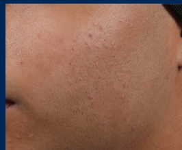
3 MONTHS AFTER FINAL TREATMENT SESSION